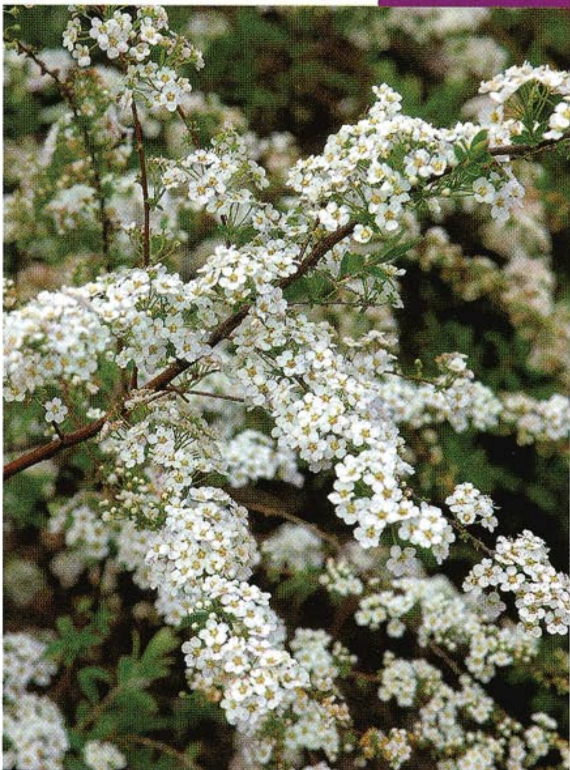
First Snow® spirea ( Spiraea × cinerea 'Grefsheim')