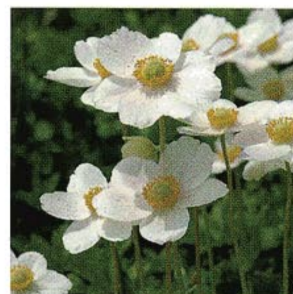
Snowdrop anemone ( Anemone sylvestris )

A semievergreen Montana native, tufted hairgrass provides structure to beds year-round. This cool-season grass looks great planted en masse and performs well in high-elevation gardens. Its slender, vertical shape and loose, airy seed heads nicely mimic the weeping branches of First Snow® spirea.