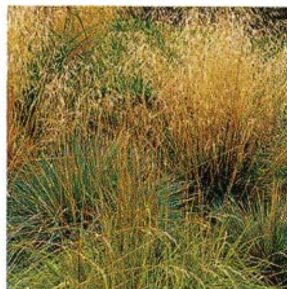
Tufted hairgrass ( Deschampsia cespitosa )